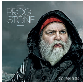
2014 OUT FROM THERE (Album)