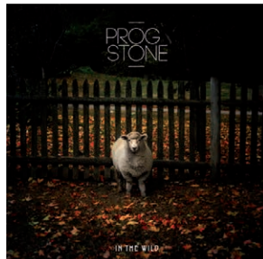
2012 IN THE WILD (EP)

Musically, the band seems to find its originality in the progressive variations of two guitars playing alongside vocal harmonizations. These guys confirm that they are already old wolves on the swiss stages and know where they are going. The perfect match of muscle and emotion finds its reward when live.